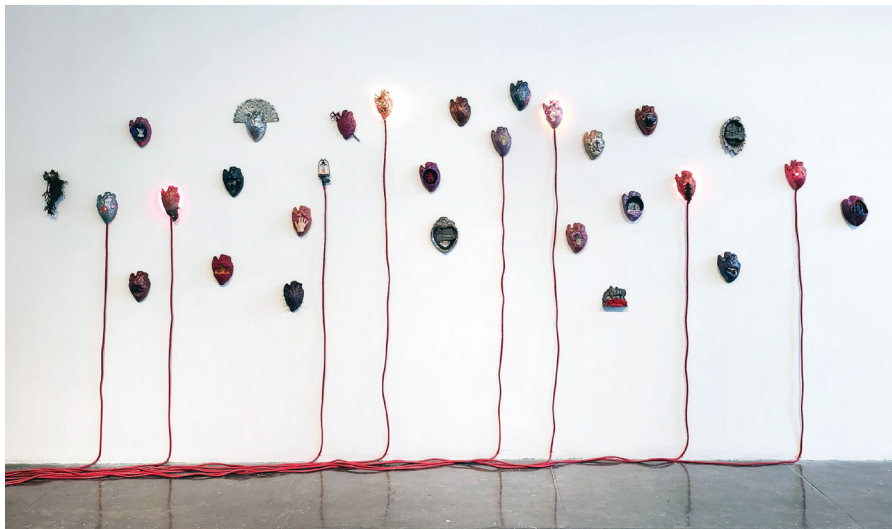
Celia Eberle, My Hearts , 2024, installation view at Cris Worley Fine Arts, Dallas.