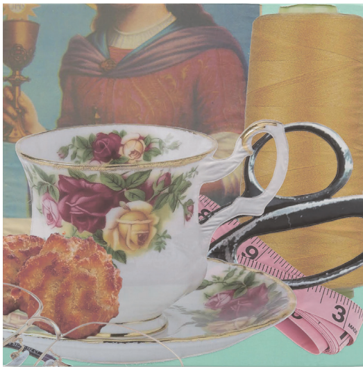
Lucia Hierro, Eutimia , 2024, felt, digital print on cotton sateen, foam, 36 x 36 x 2 in.